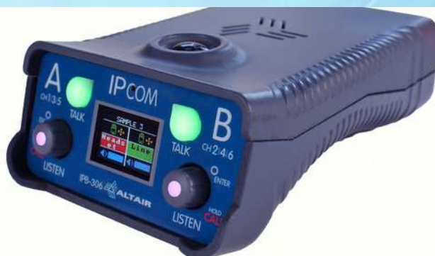
"IPB-306" six channels beltpack