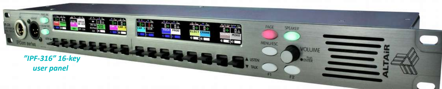
"IPF-316" 16-key user panel